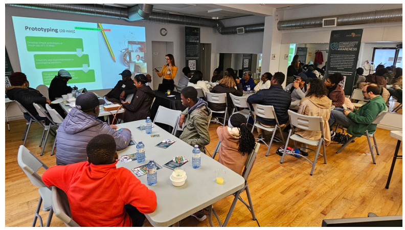
Respiratory Illnesses and Flu-shot Management Design Thinking Workshop

Victoria, March 23, 2024: The AACCCS-Issamba Centre proudly commemorated the International Day for the Elimination of Racial Discrimination with a diverse and engaging event held at the Philippine Bayanihan Community Center. Taking place on Saturday, March 23rd, from 11 am to 8 pm, the celebration brought together members of the community in a powerful display of unity and solidarity.