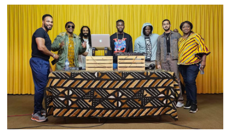
BHM Launch Reception Pre-show